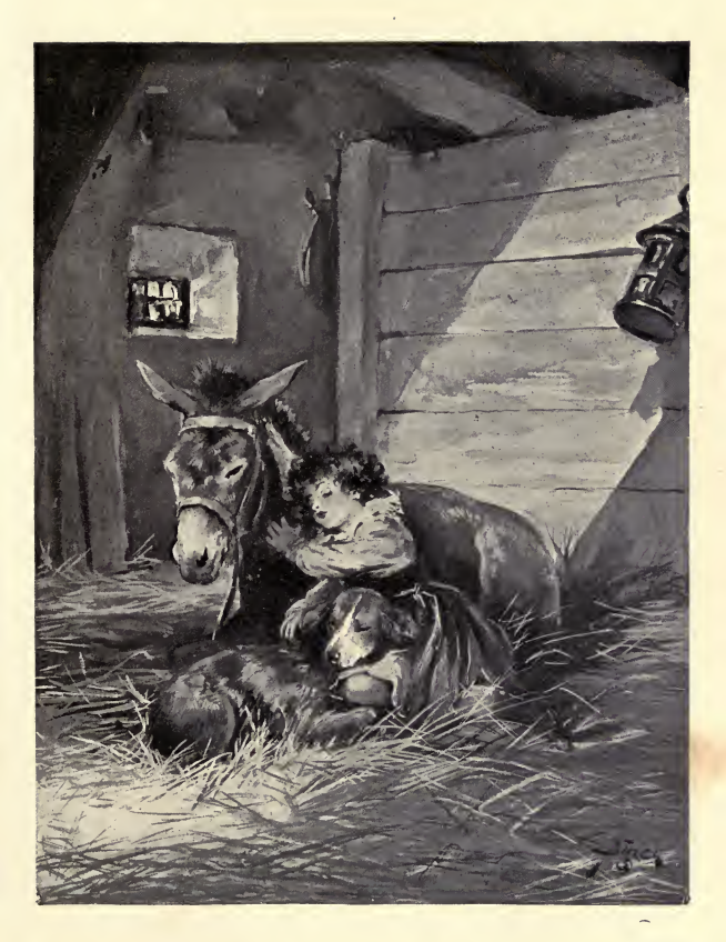
"PICCINO, WHO LAY FAST ASLEEP"